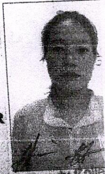
Sub-Deputy Collector Churachandpur

OFFICE OF THE SUB-DIVISIONAL OFFICER: CHURACHANDPUR