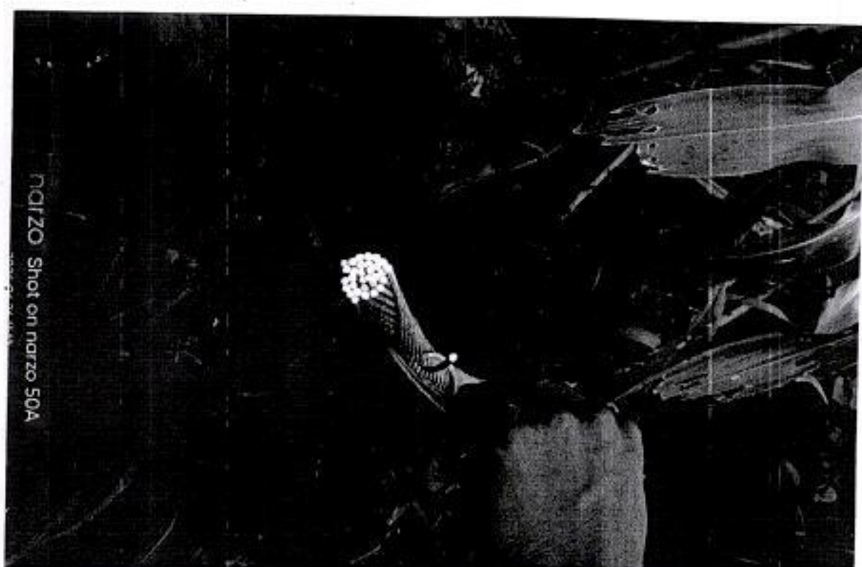
narzo Shot on narzo 50A