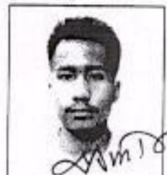
Director of Medical & Health Services, Manipur